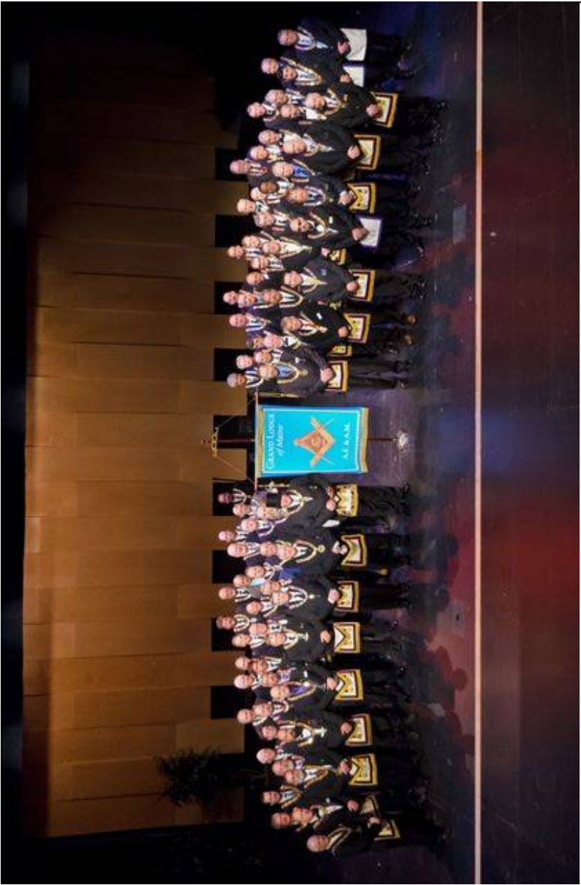
Elected and Appointed Grand Lodge Officers 2012-2013