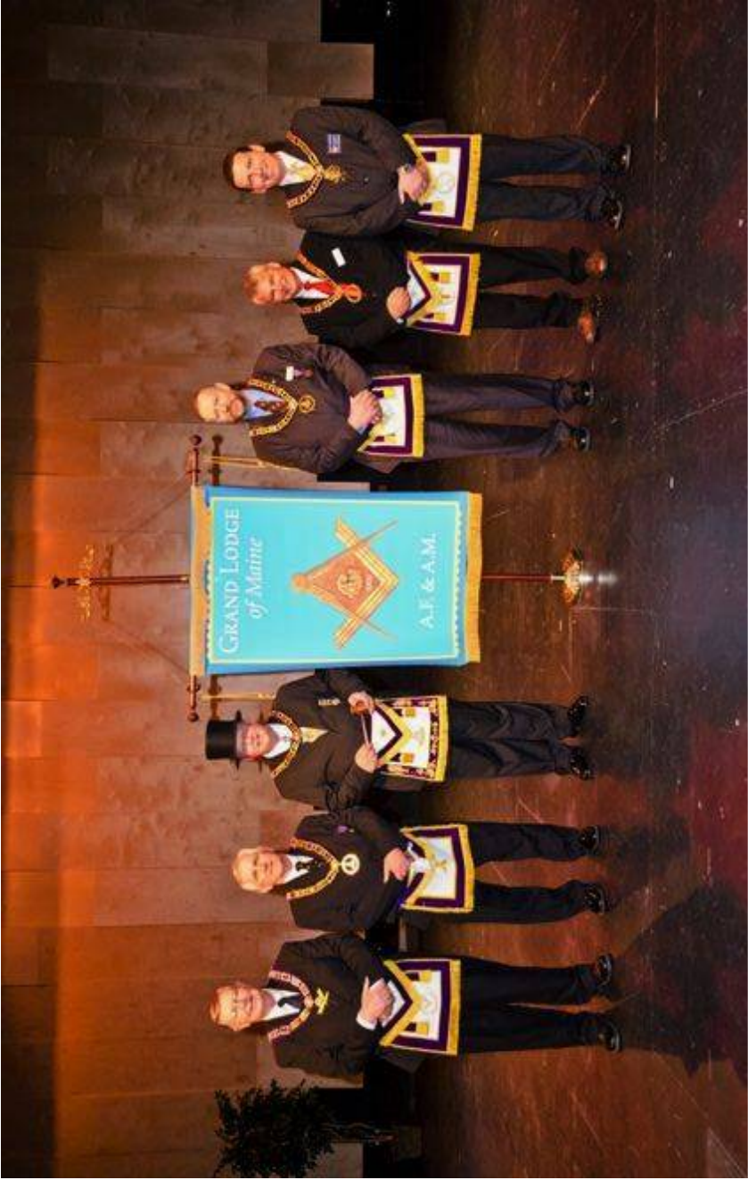
Elected Grand Lodge Officers 2012-2013