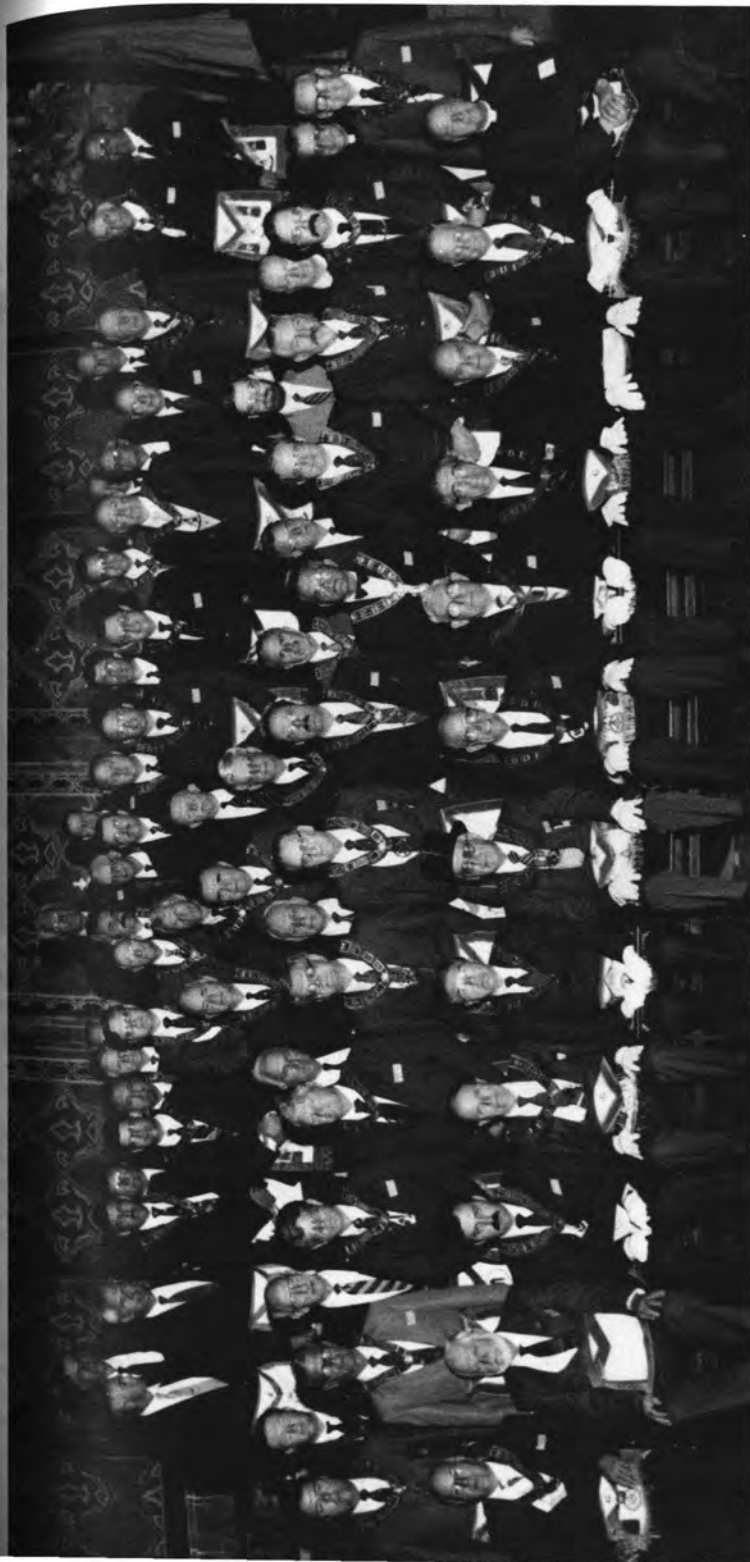
Grand Lodge Officers 1987 - 1988