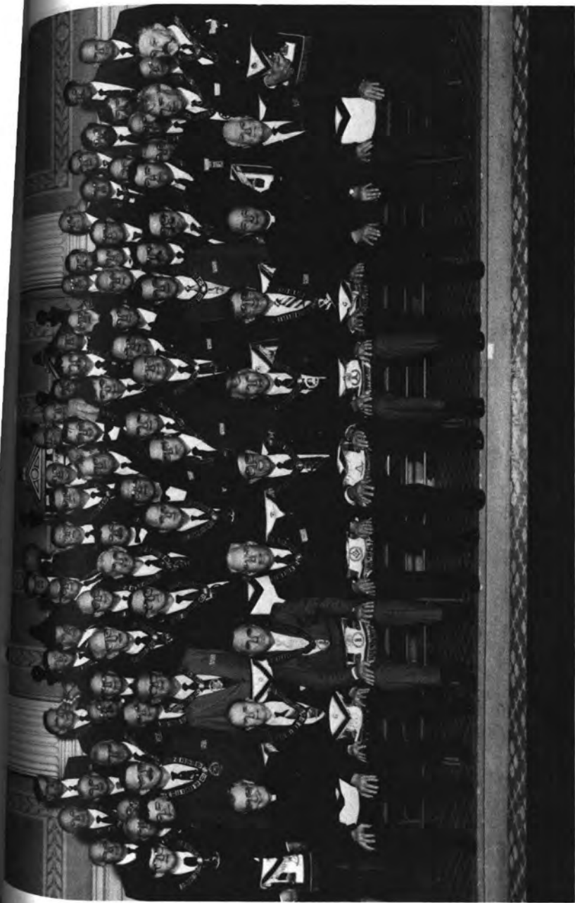
Grand Lodge Officers 1988 - 1989