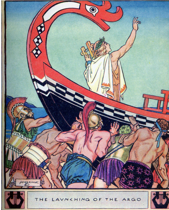
Illustration from Charles Kingsley's The Heroes . H. M. Brock, artist. Published by MacMillian, London 1936.